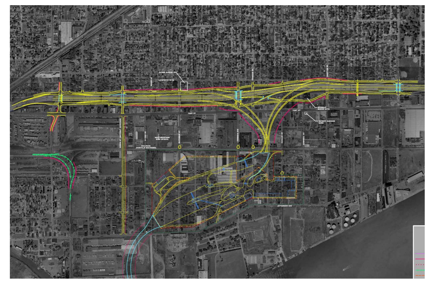
Figure 2 Hybrid Alternative Detroit River International Crossing Study