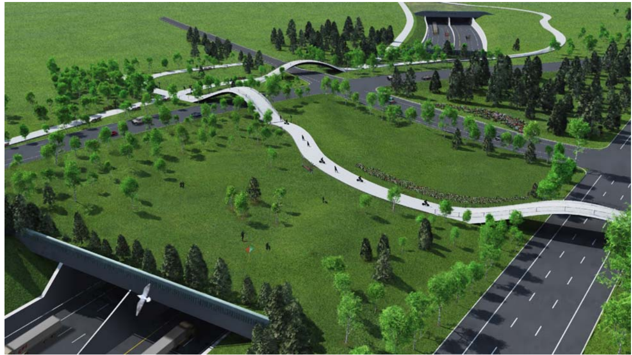
Figure 3 Image of the Windsor Essex Parkway Detroit River International Crossing Study