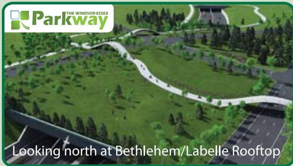
Looking north at Bethlehem/Labelle Rooftop