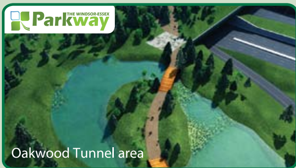
Oakwood Tunnel area

St. Clair College Campus Main Building, Room 322 2000 Talbot Road West, Windsor