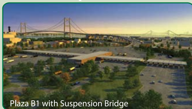
Plaza B1 with Suspension Bridge