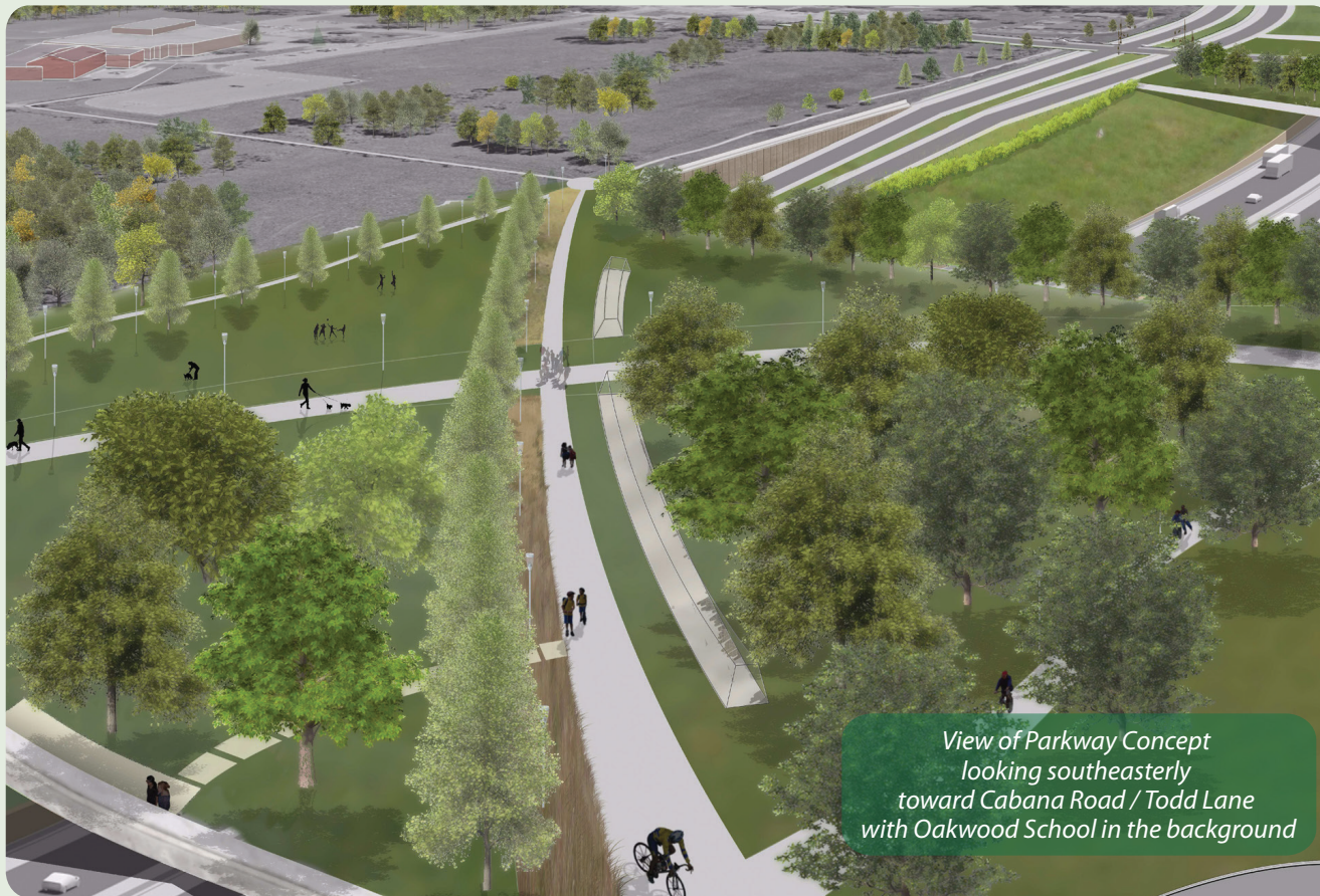
View of Parkway Concept looking southeasterly toward Cabana Road / Todd Lane with Oakwood School in the background