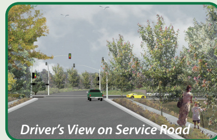
Driver's View on Service Road

Ciociaro Club, Salons A & B 3745 North Talbot Rd, Tecumseh