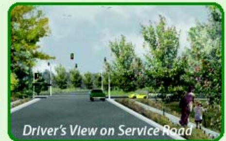
Driver's View on Service Road

2:00 P.M. to 8:00 P.M. Ciociaro Club, Salons A & B 3745 North Talbot Rd, Tecumseh