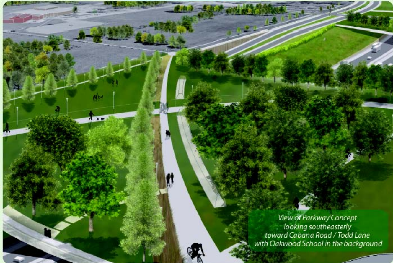
View of Parkway Concept looking southeasterly toward Cabana Road / Todd Lane with Oakwood School in the background