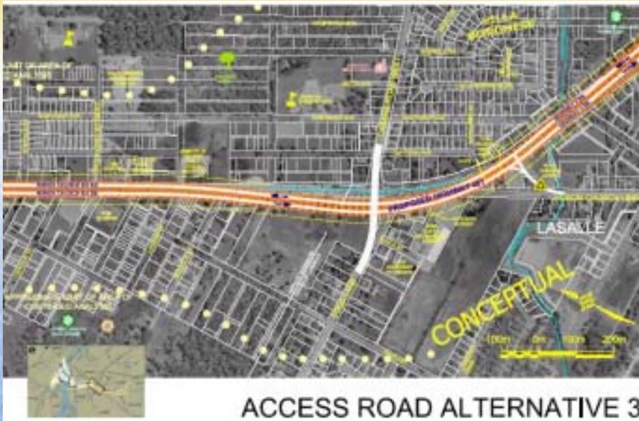
ACCESS ROAD ALTERNATIVE 3

Detroit River INTERNATIONAL CROSSING STUDY