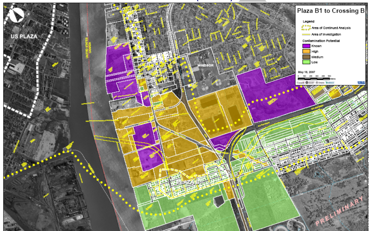
EXHIBIT 4: PLAZA B1 CROSSING B (EXHIBIT C)

The properties impacted by Plaza B1 are primarily Low risk; approximately 4.2 ha of land at the northern limits of the Plaza, however, impacts High risk properties.