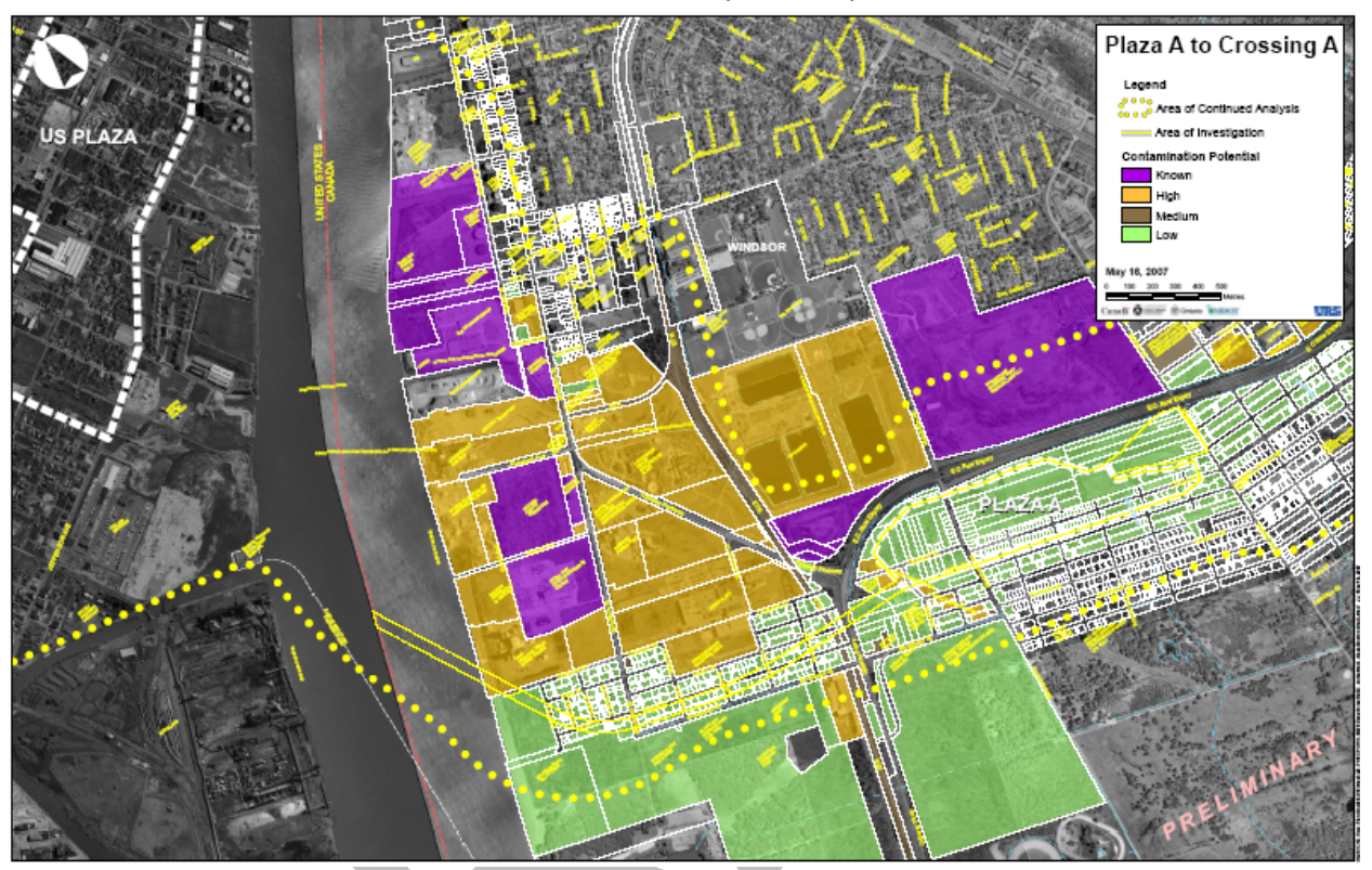
PLAZA A CROSSING A EXHIBIT 5: PLAZA A CROSSING A (EXHIBIT D)

The properties impacted by Crossing A are primarily Low risk with the exception of approximately one hectare of land located at the south-western corner of a High risk property. The property is associated with the Brighton Beach Power Station. This is the only option which does not currently impact any Known sites.