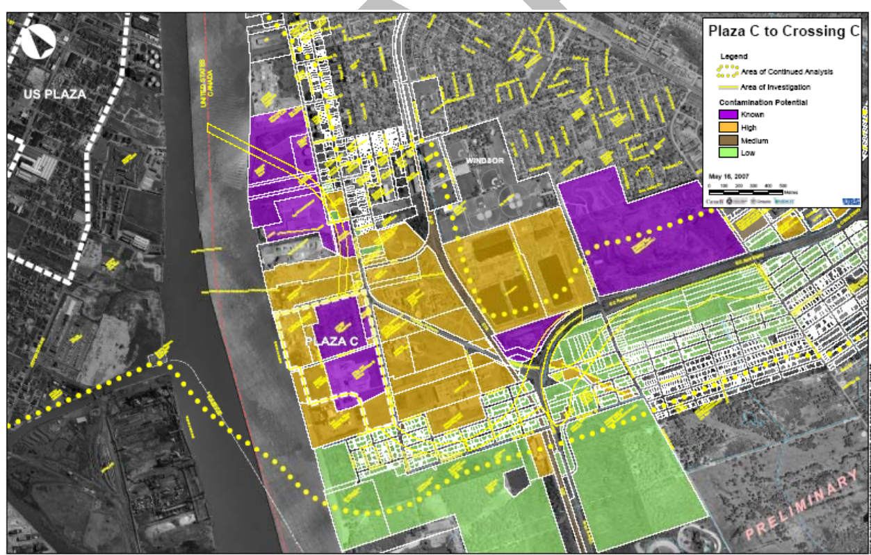
EXHIBIT 2: PLAZA C CROSSING C

The Plaza is located on several High risk properties and three Known sites. One Known site was used for coal ash disposal from 1953 to 1962. The other landfill (closed in 1953) is occupied by a transformer station (MOE # 6058).