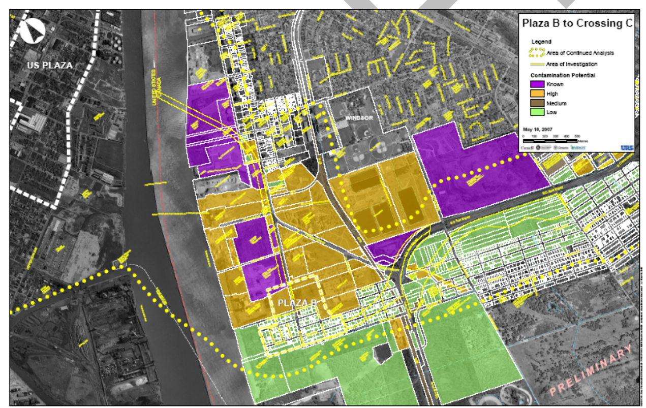
EXHIBIT 3: PLAZA B CROSSING C

Approximately 19.6 ha of the properties impacted by Plaza B are Low risk. While approximately 12.5 ha of the Plaza covers High risk properties.